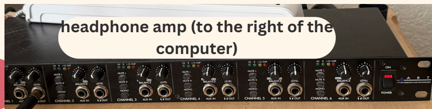
headphone amp (to the right of the computer)