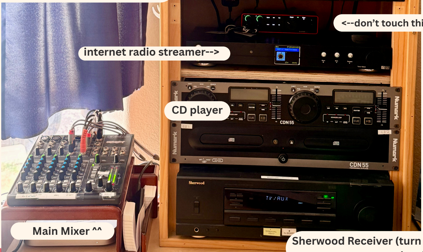
<--don't touch this pls