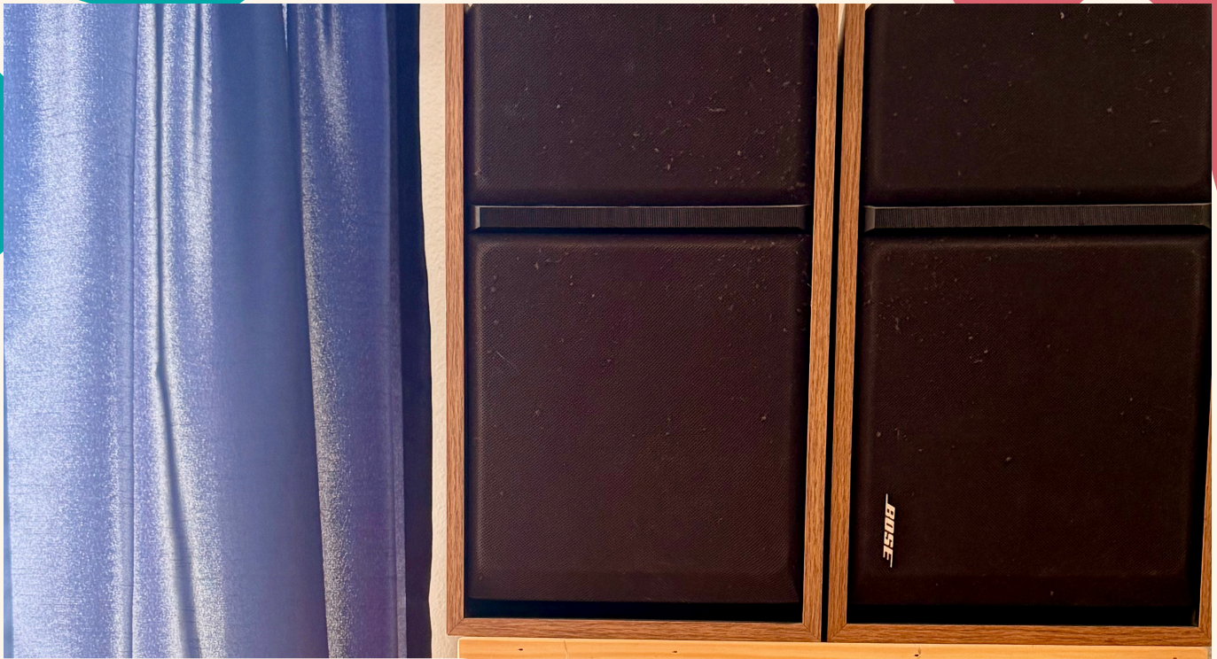
Furman power strip (keep on at all times) -->